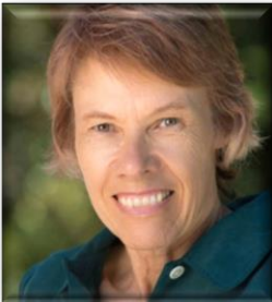
AMBER DeANN Facebook Page