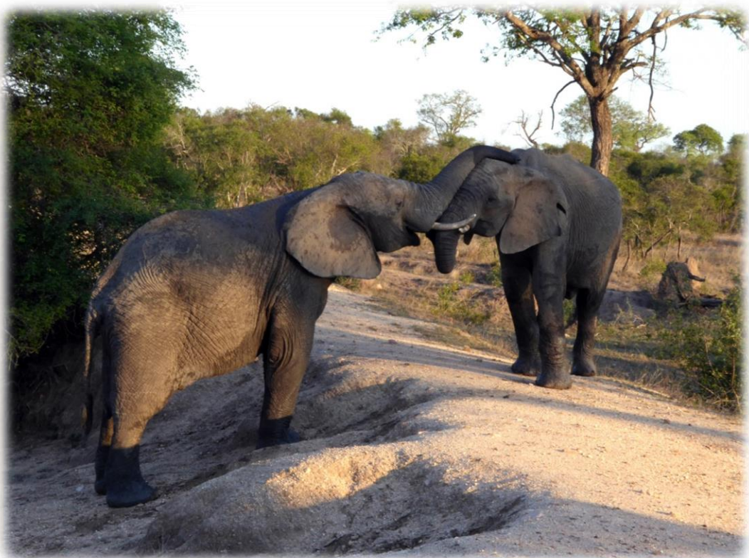
"Big Love"