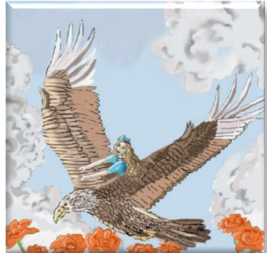
Lil' Oriole

The meeting's FREE and open to those who want to improve their own writing or help others with theirs.