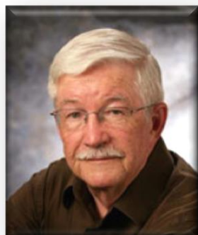
ART CAREY Signage Facility Contact