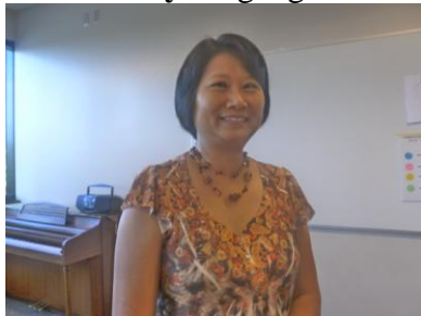
Carol Hall Facebook Page, Meetup,