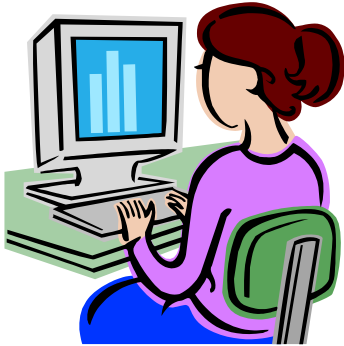
Myrla busy on the computer.