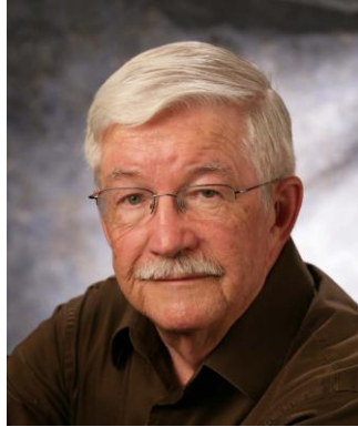
Art Carey –Signage