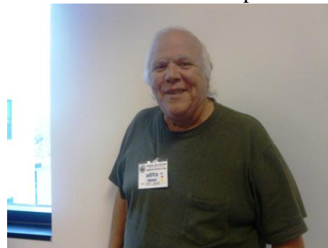
Bruce Haase Sound Equipment Book Exchange