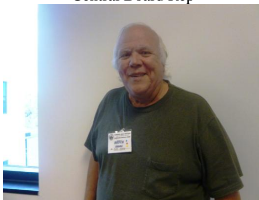
Bruce Haase Sound Equipment Book Exchange